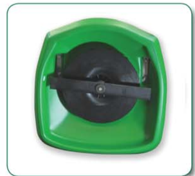
Steel bar blade